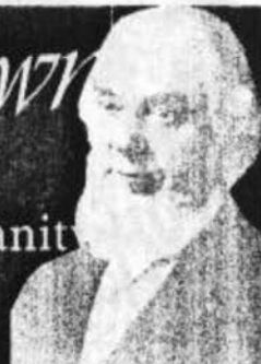
Charles Taze Russell